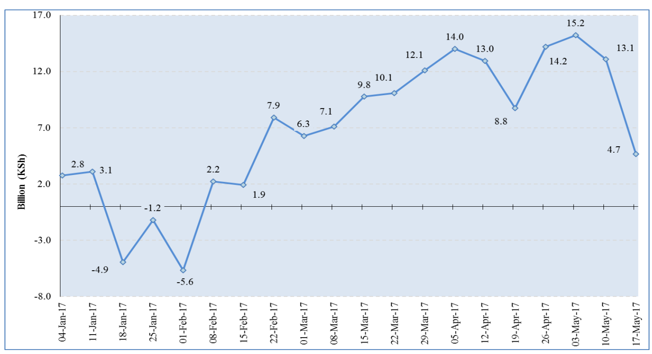
CHART A: COMMERCIAL BANKS EXCESS RESERVES